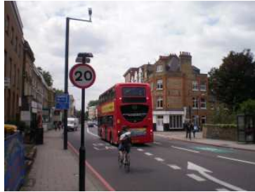
Camberwell Town Centre