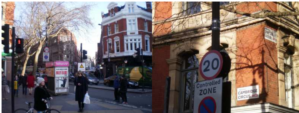
20mph Limits in Camden