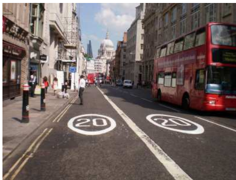
20mph Limits in the City of London