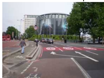
IMAX Roundabout Waterloo