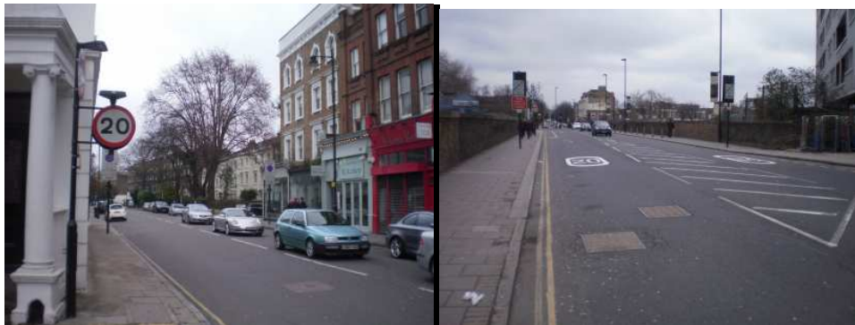
20mph Limits in Islington